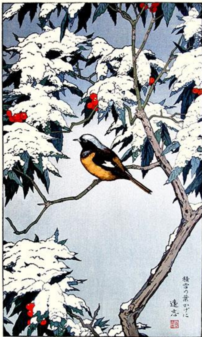
7 Japanese laurel ( Aucuba japonica ) and Daurian redstart ( Phoenicurus aureoreus ) by Tōshi Yoshida, 1977, woodblock print entitled sitting under snow-covered leaves, 340 x 540 mm