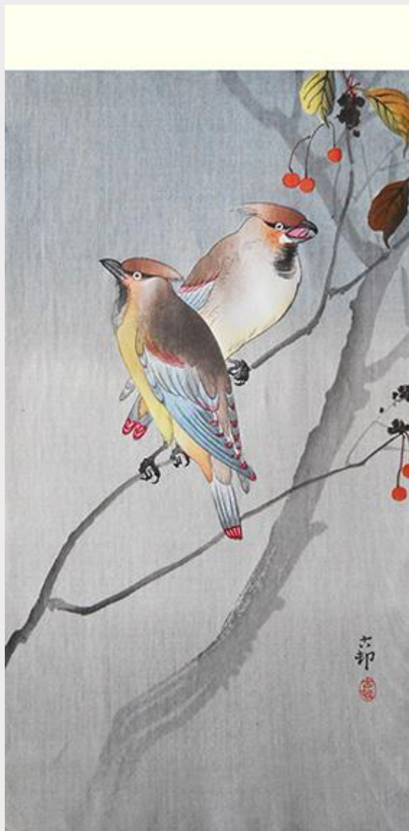
9 Cherry ( Prunus sp.) and Japanese waxwing ( Bombycilla japonica ) by Koson Ohara, woodblock print, 190 x 380 mm