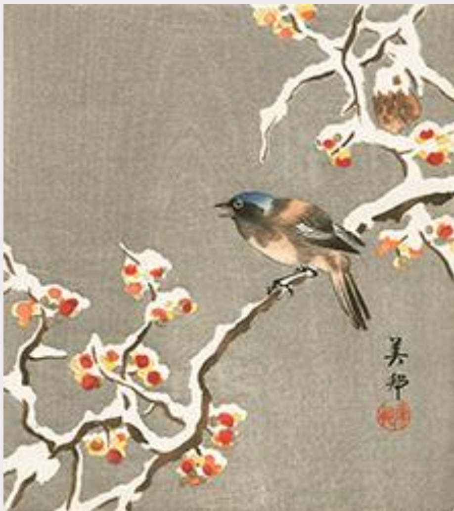
5 Japanese bittersweet ( Celastrus orbiculatus ) and Daurian redstart ( Phoenicurus aureus ) by Bihō Takahashi, woodblock print, 240 x 270 mm