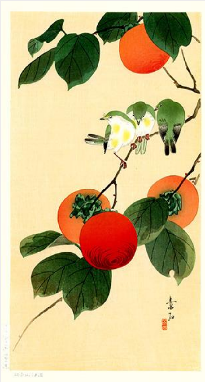
1 Japanese persimmon ( Diospyros kaki ) and Japanese white-eye ( Zosterops japonicus ) by Soseki Komori, woodblock print, 225 x 400 mm