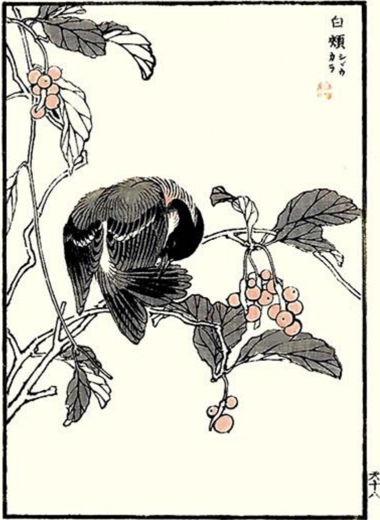
17 Schisandra ( Schisandra chinensis ) and great tit ( Parus major ) by Bairei Kōno, 1881, woodblock print included in Bairei Hyakuchō Gafu (i.e., One Hundred Birds by Bairei), 165 x 250 mm